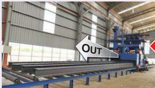
② Complete blasted beams after exiting blasting chamber