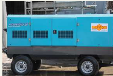
Driven air compressor