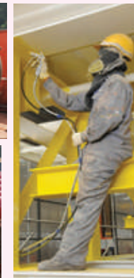
Painting in progress