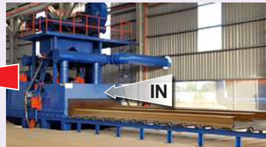
① Structure beams entering the blasting chamber