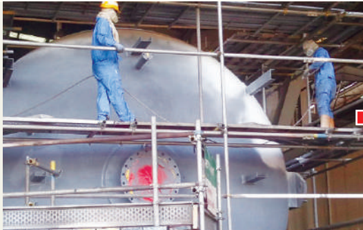
Painting of pressure vessel in progress